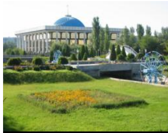
Tashkent The Oliy Majlis (the supreme representative body)

http://www.travelchampion.com/world-travel-photos.htm