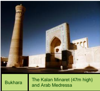
Bukhara The Kalan Minaret (47m high) and Arab Medressa